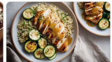
Grilled chicken with honey mustard sauce,...