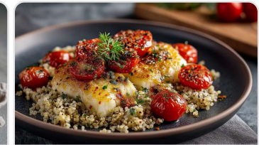
Garlic tomato cod with quinoa