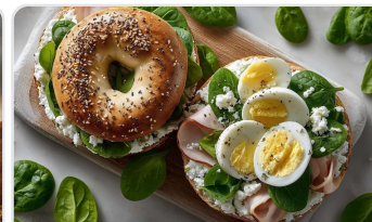
High-protein lactose-free chicken, egg...