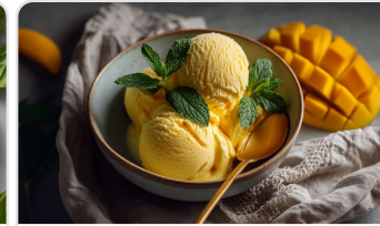
Protein fruity ice cream with cottage cheese