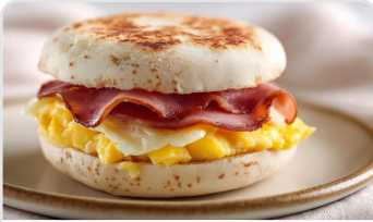
English muffin egg-bacon (lactose-free)