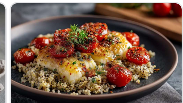
Garlic tomato cod with quinoa