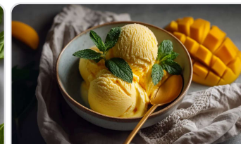
Protein fruity ice cream with cottage cheese