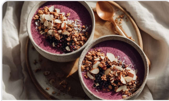
Skr and berry smoothie bowl