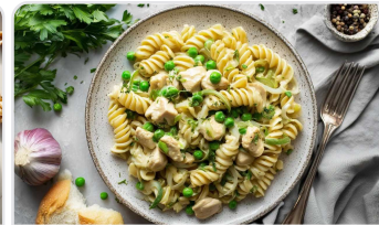
Creamy chicken and pea pasta