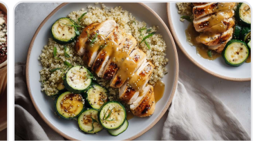
Grilled chicken with honey mustard sauce,...