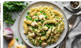
Creamy chicken and pea pasta