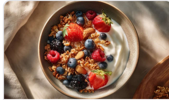
Protein yogurt with granola and fruits