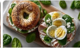
High-protein lactose-free chicken, egg...