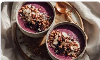
Skyr and berry smoothie bowl