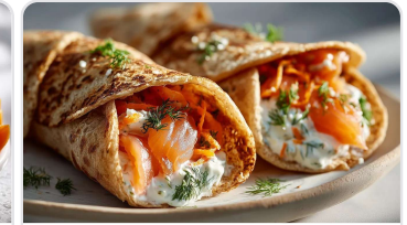
Lactose-free buckwheat galette wrap with...