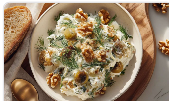
Savory skyr with olives and walnuts