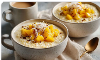
Coconut mango quinoa porridge