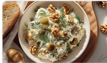
Savory skyr with olives and walnuts