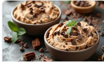
Chickpea cookie dough