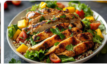
Tropical chicken and mango salad