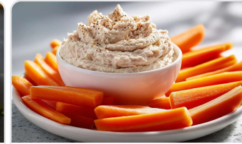
Lactose-free tuna rillettes with carrot...