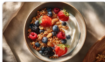
Protein yogurt with granola and fruits