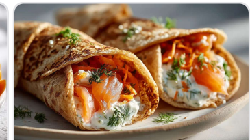
Lactose-free buckwheat galette wrap with...