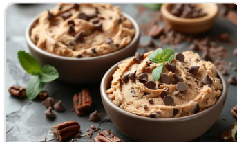
Chickpea cookie dough