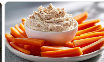
Lactose-free tuna rillettes with carrot...