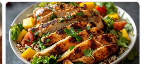
Tropical chicken and mango salad