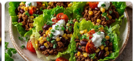
Beef taco-style lettuce wraps