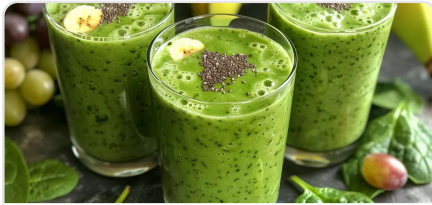
Green spinach and grape smoothie