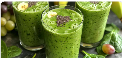
Green spinach and grape smoothie