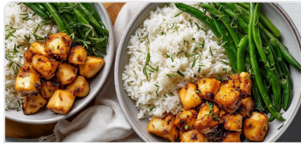
Coconut rice with chicken and green beans