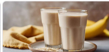
Protein banana oat smoothie