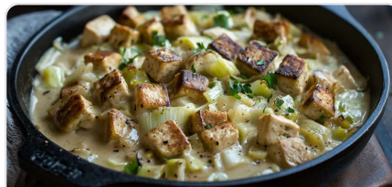
Smoked tofu and leek fondue