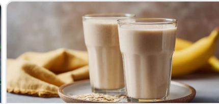
Protein banana oat smoothie