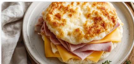
Cloud bread ham and cheese sandwich