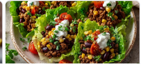
Beef taco-style lettuce wraps