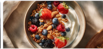
Protein yogurt with granola and fruits