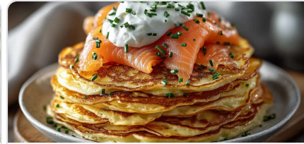
Savory pancakes with smoked salmon