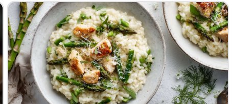
Chicken and asparagus risotto