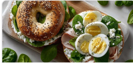
High-protein chicken, egg and spinach bagel