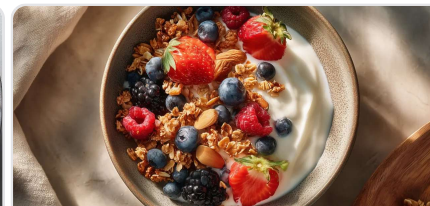
Protein yogurt with granola and fruits