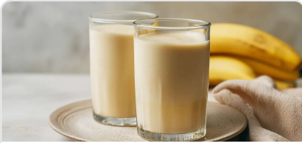
Vanilla banana protein smoothie