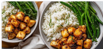
Coconut rice with chicken and green beans