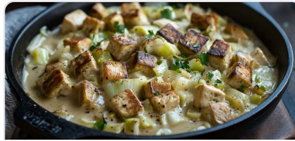
Smoked tofu and leek fondue