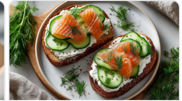
Smoked salmon and plant-based yogurt toast