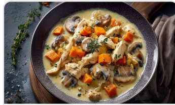
Lactose-free sweet potato and pork...