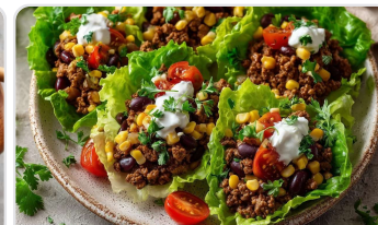
Lactose-free beef taco-style lettuce wraps