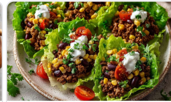
Lactose-free beef taco-style lettuce wraps