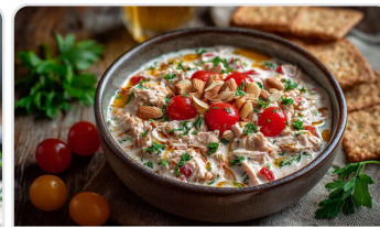
Creamy tuna bowl with wasa crispbread