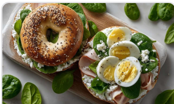
High-protein chicken, egg and spinach bagel