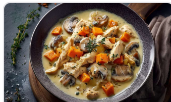
Lactose-free sweet potato and pork...