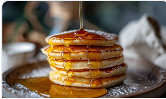
Protein oat pancakes