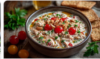
Creamy tuna bowl with wasa crispbread