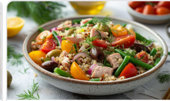
Mediterranean tuna and quinoa salad