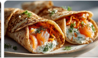
Buckwheat galette wrap with creamy salmon