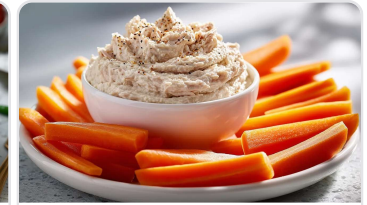
Lactose-free tuna rillettes with carrot...