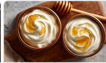
Greek yogurt with honey/agave