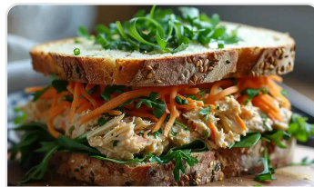
Hummus and tuna sandwich