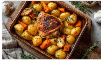
Roasted chicken thigh with potatoes and...