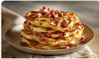
Savory ham and emmental pancakes