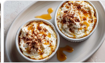
Cottage cheese and applesauce