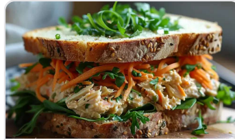
Hummus and tuna sandwich