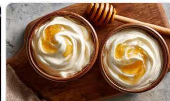
Greek yogurt with honey/agave