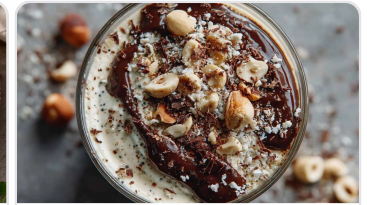
Protein-rich hazelnut skyr parfait