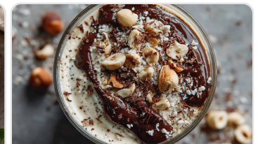
Protein-rich hazelnut skyr parfait