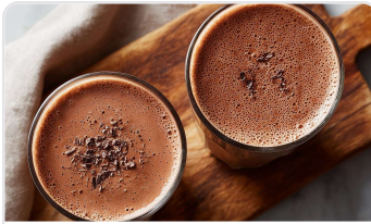
Lactose-free banana cocoa smoothie