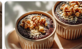
Chocolate and red bean brownie