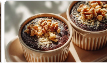
Chocolate and red bean brownie