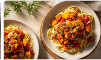
Basque-style chicken with pasta and piperade