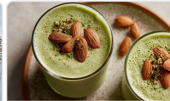
Lactose-free banana matcha protein smoothie