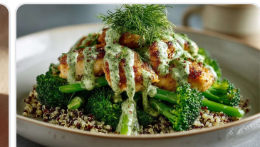
Green quinoa with chicken