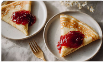
High-protein crêpes with jam