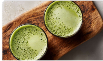
Yogurt and matcha smoothie