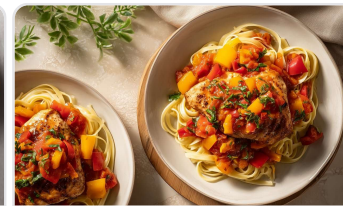
Basque-style chicken with pasta and piperade