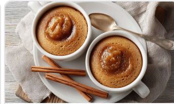
Winter mug cake with cinnamon and...