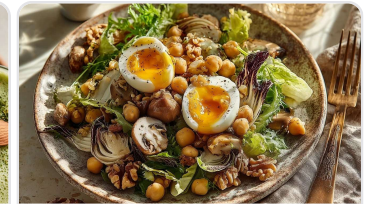
Chickpea salad with mushrooms and...