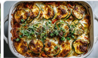
Vegetable lasagna with ham