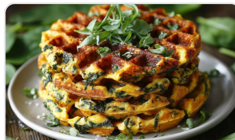
Savory spinach waffle