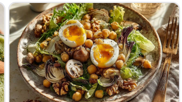
Chickpea salad with mushrooms and...