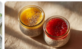
Chia pudding with jam