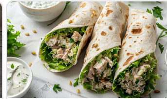
Easy tuna and parmesan wrap