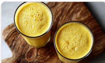
Turmeric ginger lemon apple smoothie