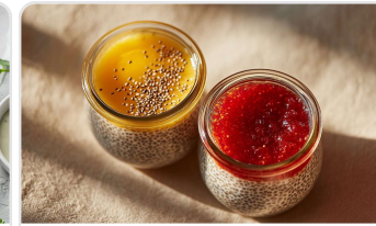
Chia pudding with jam