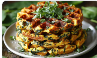
Savory spinach waffle