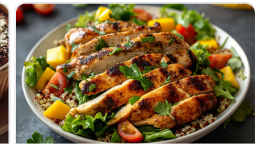
Tropical chicken and mango salad