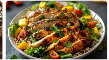
Tropical chicken and mango salad