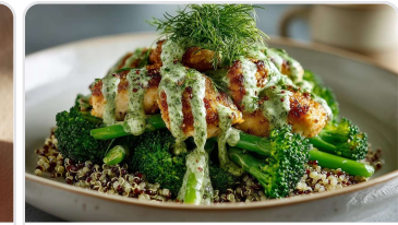
Green quinoa with chicken