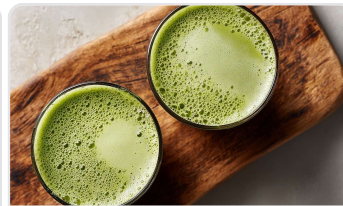
Yogurt and matcha smoothie